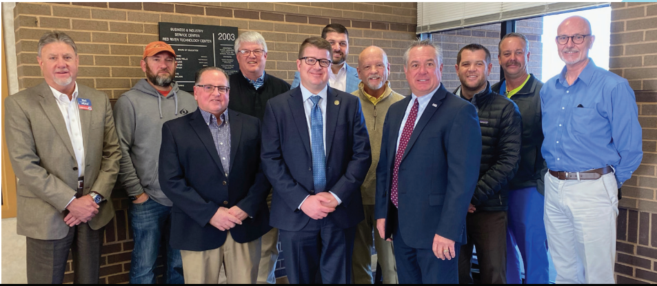
DAEDF Board of Directors at the 2022 Annual Membership Meeting